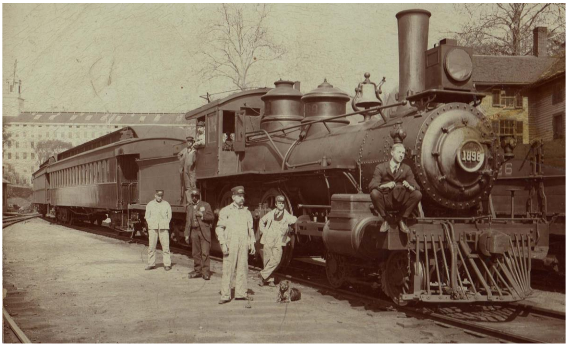
Conductor Henry Vanness and train crew stand with an engine in the Rockville train yard

A description of the badge followed: "In gold and enamel, the design is a ribbon border, enclosing a miniature lantern; on the border appears the letters N.Y. & N.E.R.R. Conductor and at the sides Semper Paratus , all in blue and black enamel. The lantern has a red enamel globe in the center of which is a small diamond for a light; the design being to represent the faithful conductor who never fails to have the proper signal ready in case of an emergency by day or night." (RJ 7/2/1880)